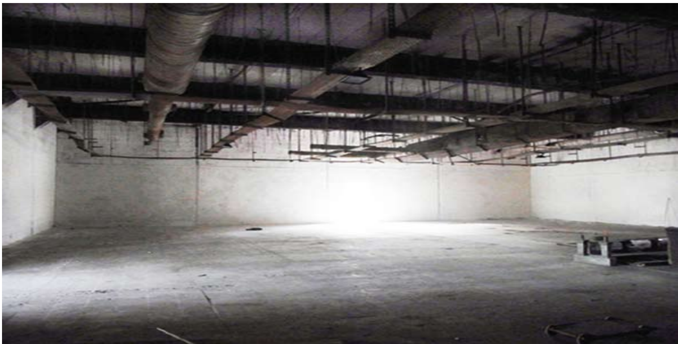
- painting works(ca. 600 m 2 )