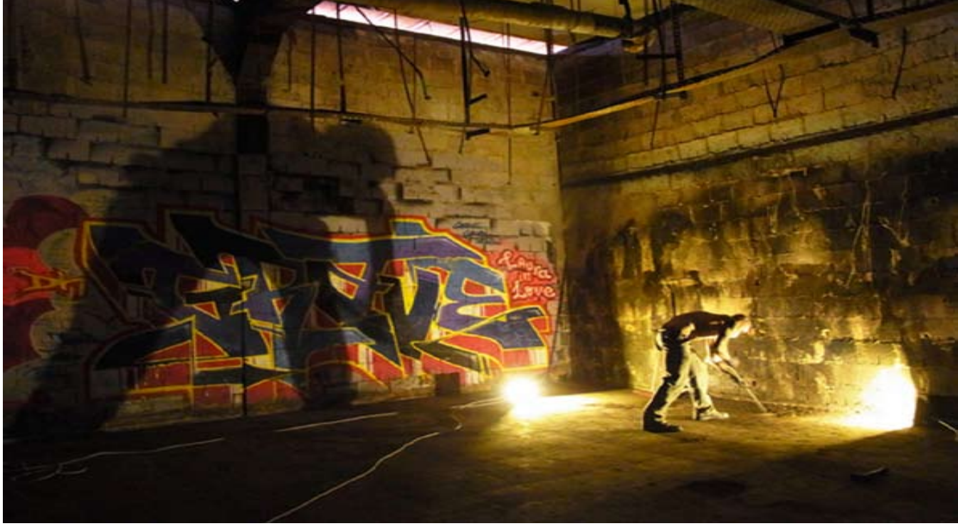
- The removal of the burned carpet and glass wool from the roof